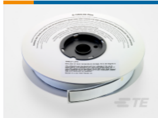
TE Part # 195133-000 S1255-04-3/4X100FT